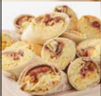
breakfast wrap platter