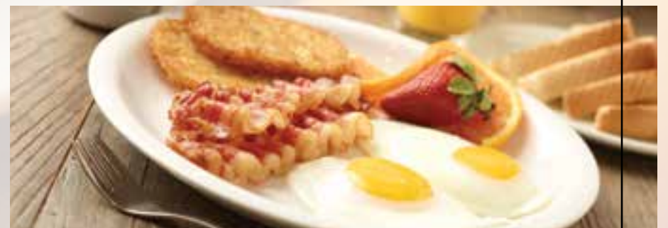
the viking breakfast buffet