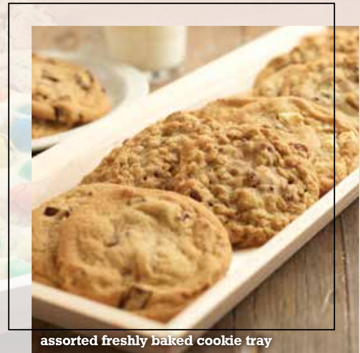
assorted freshly baked cookie tray

vanilla ice cream, fresh strawberries, blackberries, red raspberries, blueberries, maraschino cherries, chocolate, caramel & butterscotch served with an assortment of toppings & whipped cream 7 per person