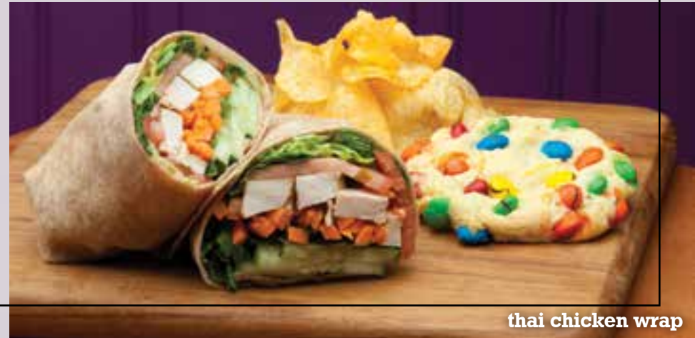
thai chicken wrap

pasta salad • broccoli delight salad • fresh salsa & tortilla chips hummus & tortilla chips • fresh fruit • kettle potato chips