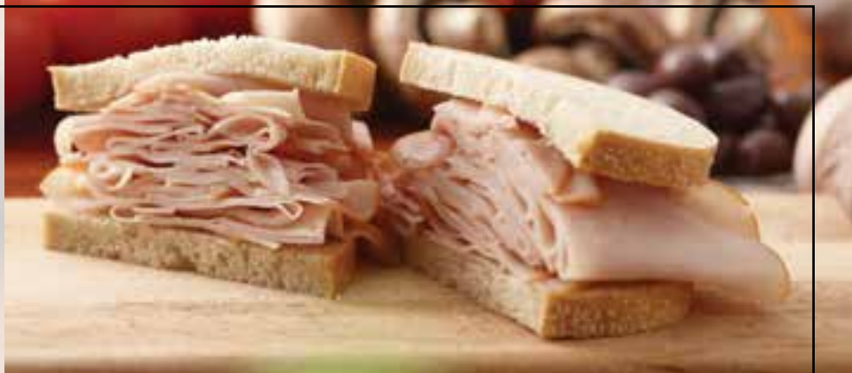
roast turkey deli sandwich

garden veggie chef - mixed greens, tomato, cucumber, carrots, broccoli, cheddar & choice of dressing