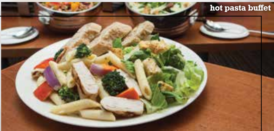
hot pasta buffet